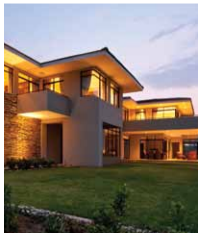
Private Residence Built on Stand