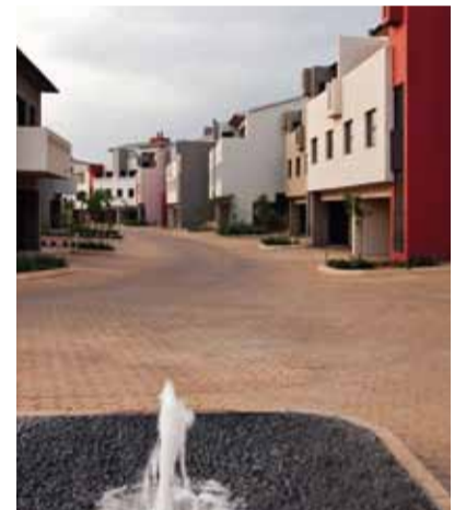
Lombardy Fountains Units