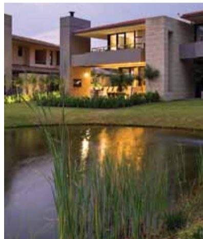
Lombardy Lakes Unit